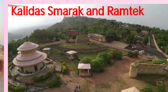
Kalidas Smarak and Ramtek